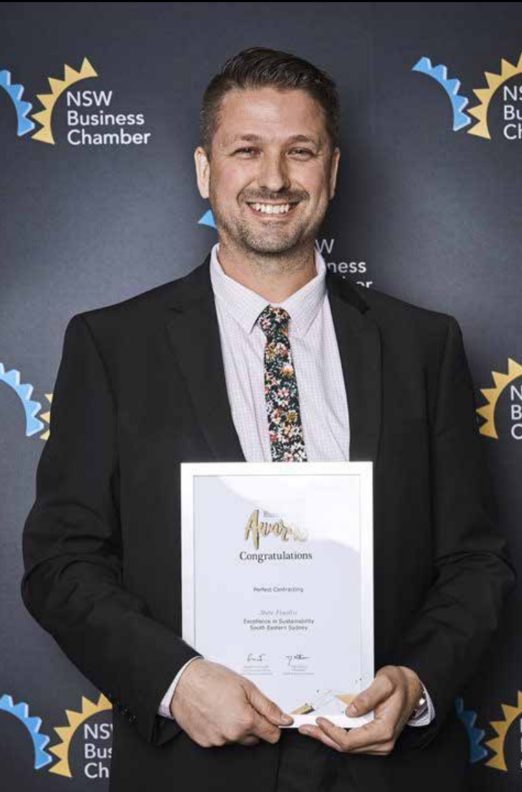
Winners of Excellence in Sustainability

WE BELIEVE THAT WE CAN DO OUR PART TO HELP OUR ENVIRONMENT AND DECREASE THE AMOUNT OF WASTE GENERATED BY THE CONSTRUCTION INDUSTRY.